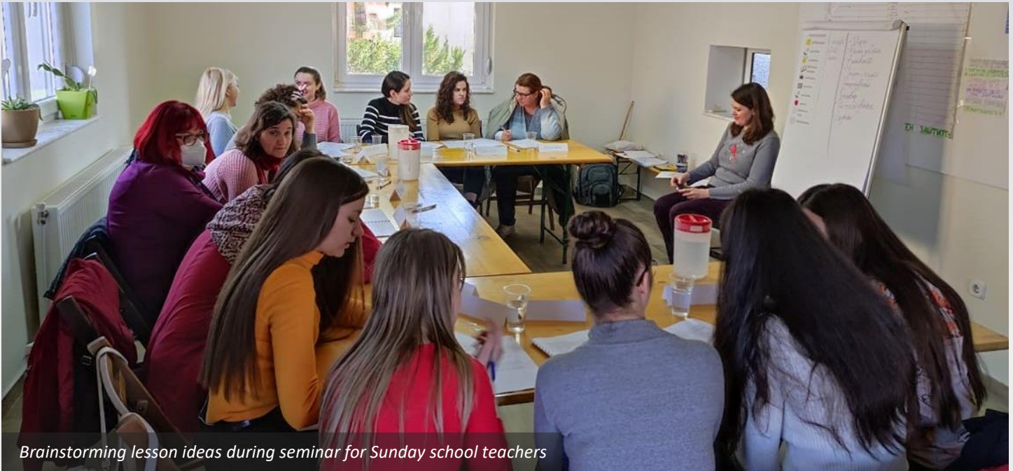
Brainstorming lesson ideas during seminar for Sunday school teachers

“I thank God for this training, we learned a lot, and I also enjoyed hanging out.”