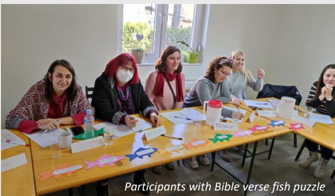
Participants with Bible verse fish puzzle

In the second and third sessions, we discussed how to prepare lessons for our classes. First, we talked about how to choose a Bible story or lesson topic and then how to determine the main point or “key takeaway” from the lesson. We said it was very important to spend time praying about this, so our lessons are clear, effective and cohesive. Once we know the main point God wants us to teach the children that week, we can then design all of the other activities to flow out of that main point. We talked about making the song choices, Bible verse,