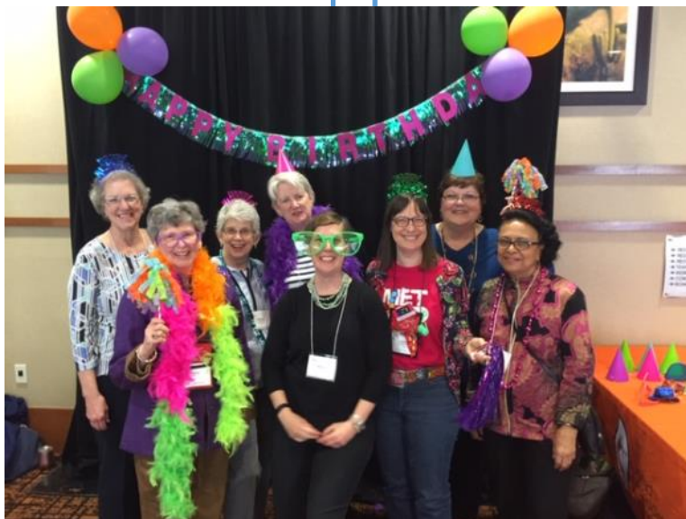
From UMW LDD training 2019