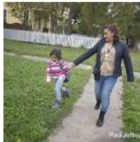
Families belong together.

(from UMW National Website) Updated: 6/21/2018