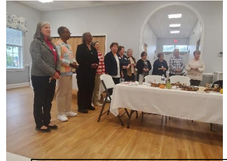
Three Notch'd Team installation for 2023 (not all officers were present)